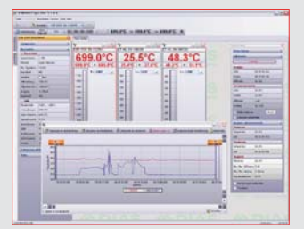
only for PYROSOFT Spot Pro

For evaluation and processing of measured data obtained DIAS provides two software variants for its pyrometer PYROSPOT . These are the free Windows software PYROSOFT Spot and the pay version PYROSOFT Spot Pro . The Pro version allows the measurement, visualization and measurement recording of several simultaneously connected pyrometers, whereas this is possible with the free version only for one connected pyrometer.